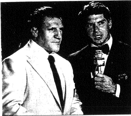
WWF head Vince McMahon doubles as TV announcer, here with longtime champ Bruno Sammartino.

neanderthals rolling around on the mat and slicing their heads with razors."