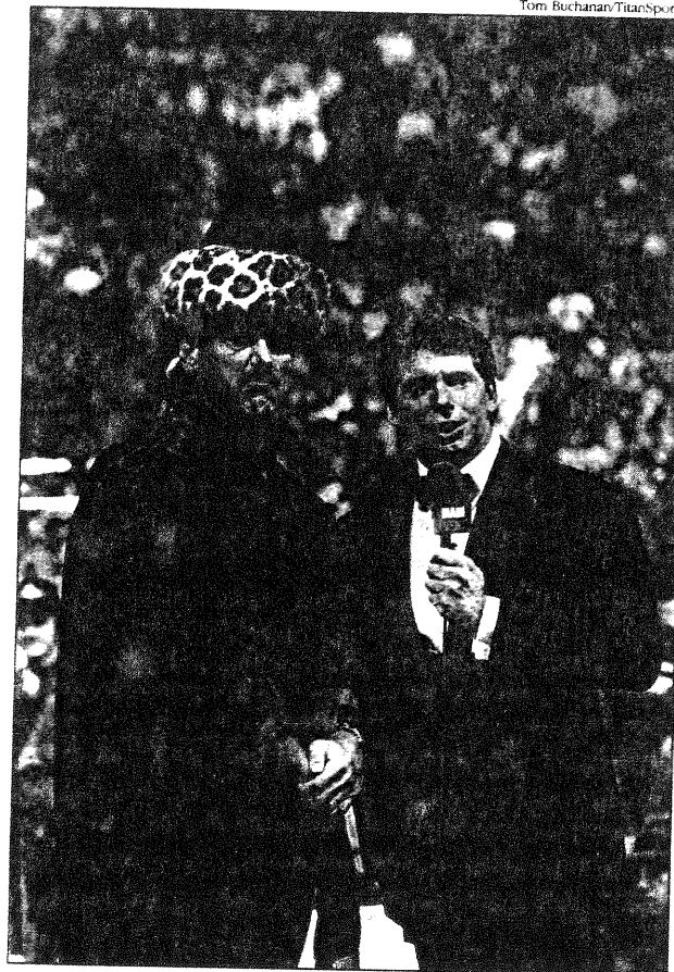
Vince McMahon, with wrestler Jesse Ventura "I do my own thinking, got a lot of big plans."

McMahon declined to be interviewed for this article.