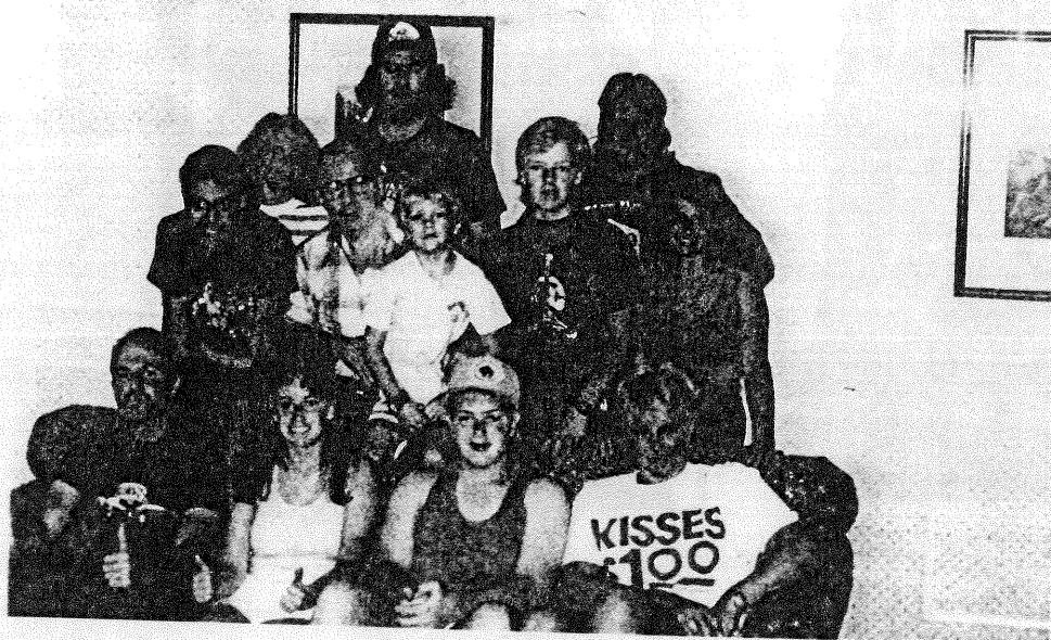
Some of us in the lobby of the hotel.