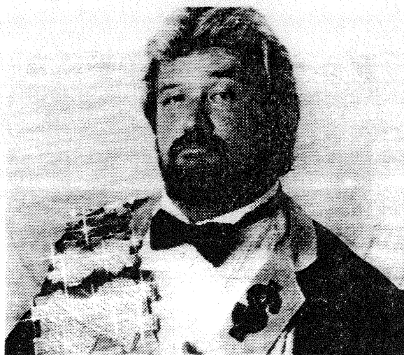
BELT HIM ONE: Ted DiBiase, "The Million Dollar Man"

And there's The Ultimate Warrior video ($59.95 retail) in which he tries to regain the Interconti-